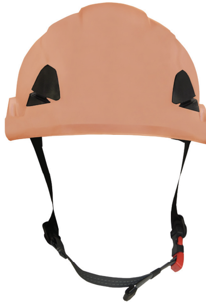
(Front with Chin Strap)