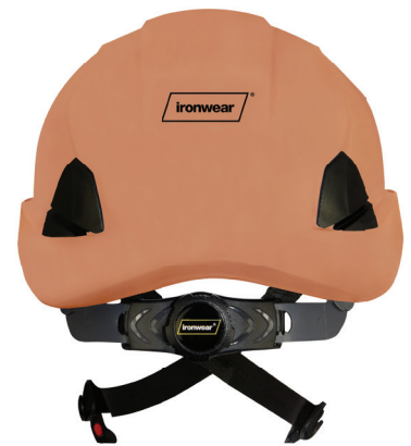
(Back with Ratchet)